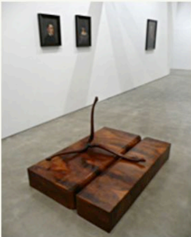
Markus Schinwald at Yvon Lambert, installation view