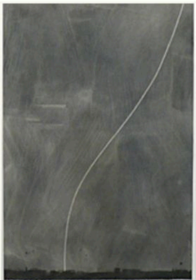
Anthony McCall's Projected Column , 2009, at Sean Kelly Gallery