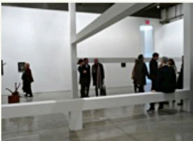
Markus Schinwald at Yvon Lambert, installation view